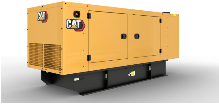
Image shown might not reflect actual configuration